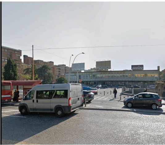
Bus stop “Stazione Autolinee”

Or, at the following stop, in via Matteotti 6, close to the exit of “Marconi express”